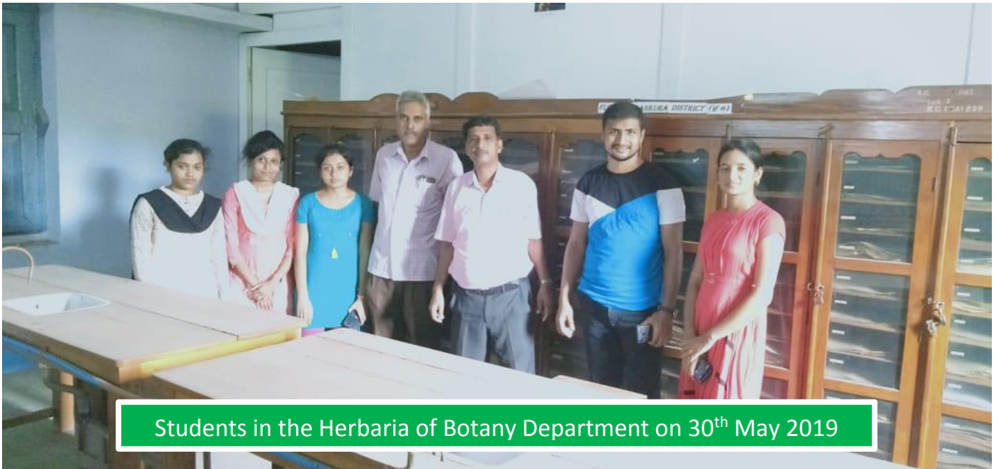
Students in the Herbaria of Botany Department on 30 th May 2019