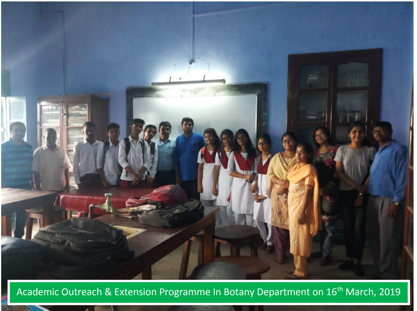
Academic Outreach & Extension Programme In Botany Department on 16 th March, 2019