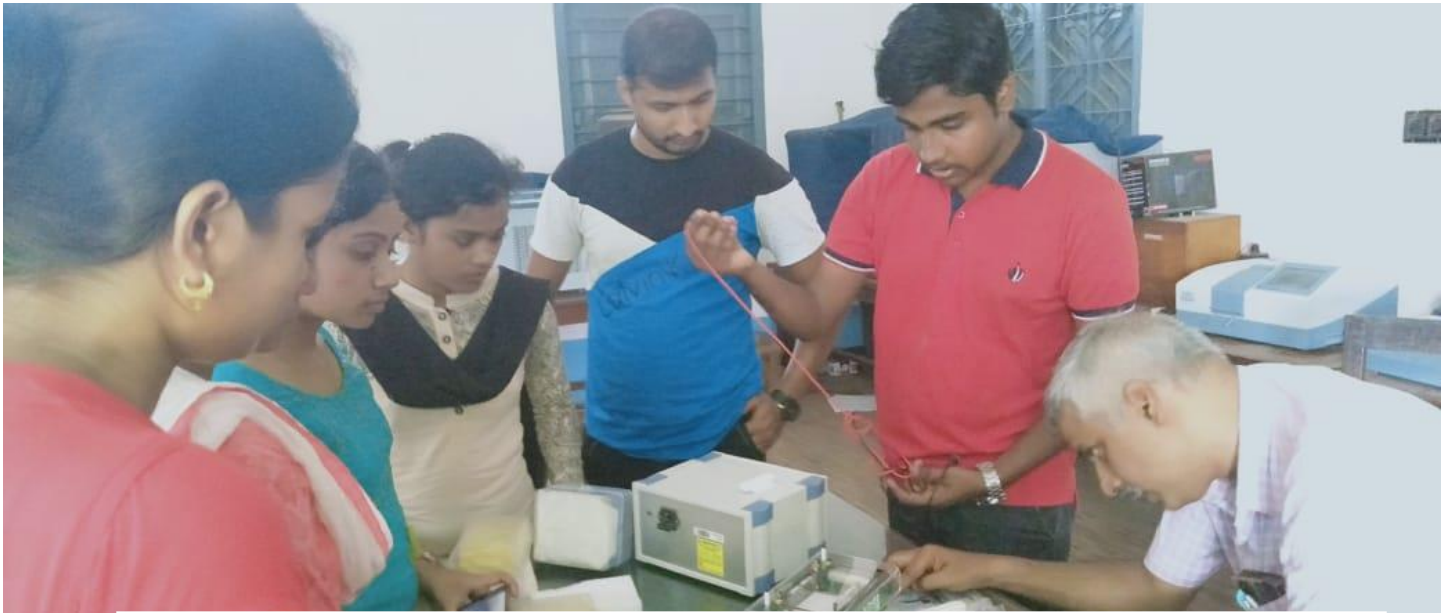
Molecular Biology Experiment in Botany Department on 30 th May 2019