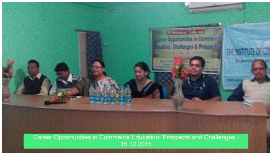
Career Opportunities in Commerce Education: Prospects and Challenges - 15.12.2015