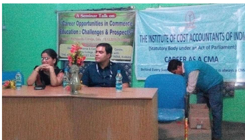
Career Opportunities in Commerce Education: Prospects and Challenges - 2015